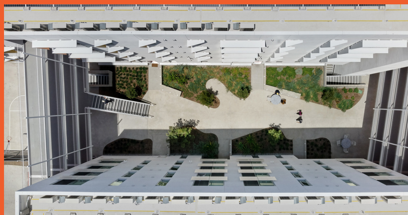
Vertical access through stairways